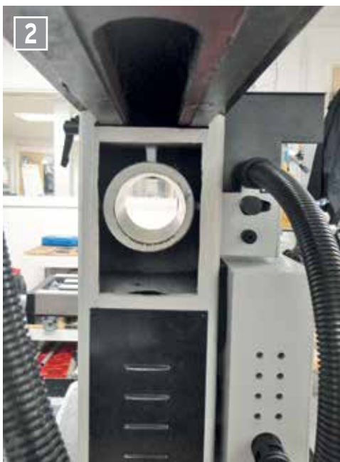
Spindle/motor assembly hole showing eccentricity with casting.

Generally the build quality is good with the machine being based on a substantial casting. There were a few areas where I thought the attention to detail was lacking slightly with one example being the off-centre bored hole for the motor/spindle assembly in the main casting ( photo 2 ). Those opting to purchase the stand/cabinet will now be supplied with the new type Axminster design that, as I described in my last review, is of excellent build quality and finish. Note the pictures in this review show the old cabinet.