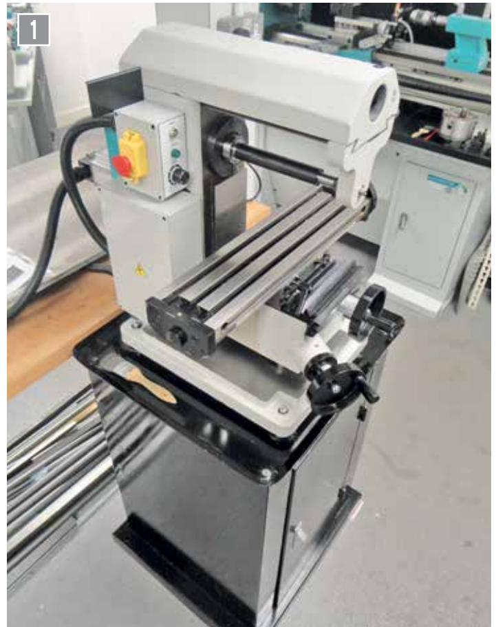
Axminster SU1 Universal Mill.