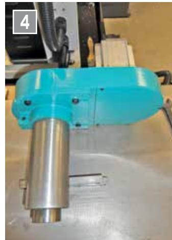
Spindle/motor assembly removed.

A pleasant surprise was that movement in the Z axis is effected by raising and lowering the knee as opposed to moving the head; a much more rigid and accurate method in my opinion.