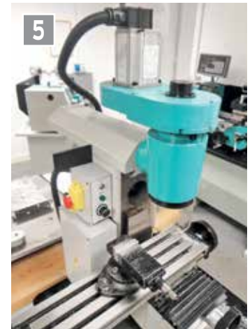
SU1 set for vertical milling.

the vertical head through which the spindle/motor assembly passes. This locates inside a hole bored into the front of the overhead support arm or ram. It is fixed in position by a single M6 clamp screw through cylindrical clamps ( photo 5 ). This clamp also allows the vertical head to pivot thus allowing the head to be squared up to the table and also angled cuts to be made; though of course there is no quill feed so angled boring or drilling is not possible. The M6 screw seems a little small for this application and I would worry about over