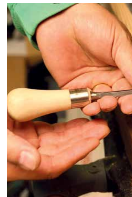
The butt chisels are great for controlled driving with the palm