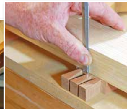
Paul Ward used his set for clean dovetailing

These chisels performed well on the ash and sapele half-blind dovetails, easily getting in to those hard-to-reach corners. The Rider chisels represent good value for money and are worth considering if your budget is limited while still looking for quality.