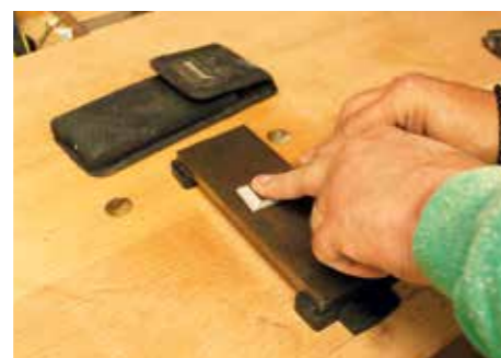
Checking the chisels for flatness was done using my faithful Trend diamond stone