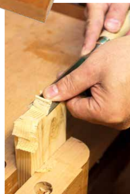
Testing on end-grain pine is usually a good indicator of a keen, consistent edge