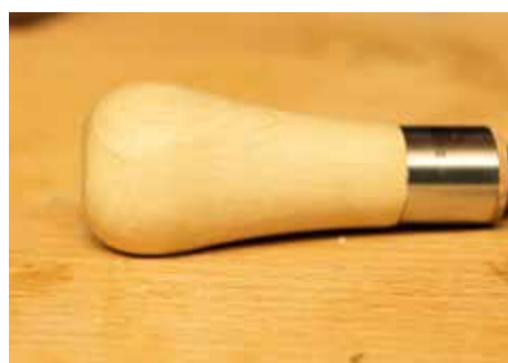
... which helps to keep it from rolling off the bench in use