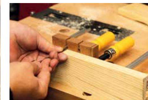
And are equally controllable for finer paring work