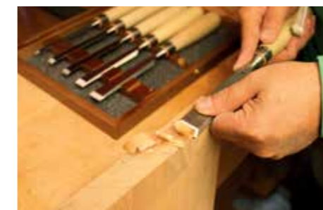
The same test on harder beech gives an indication of how the edge is capable of doing a fine job