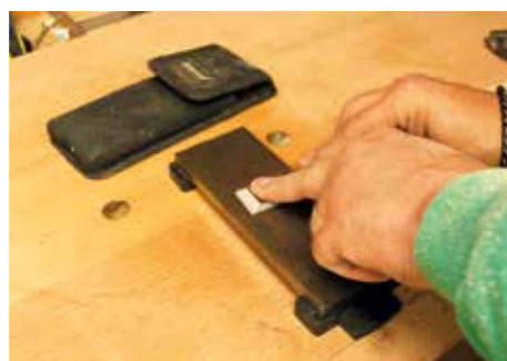
Checking the chisels for flatness was done using my faithful Trend diamond stone