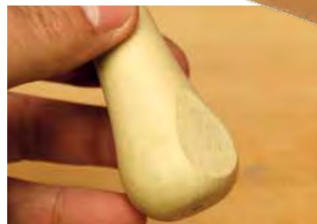
The butt chisels have a small flat on the underside of the handle...